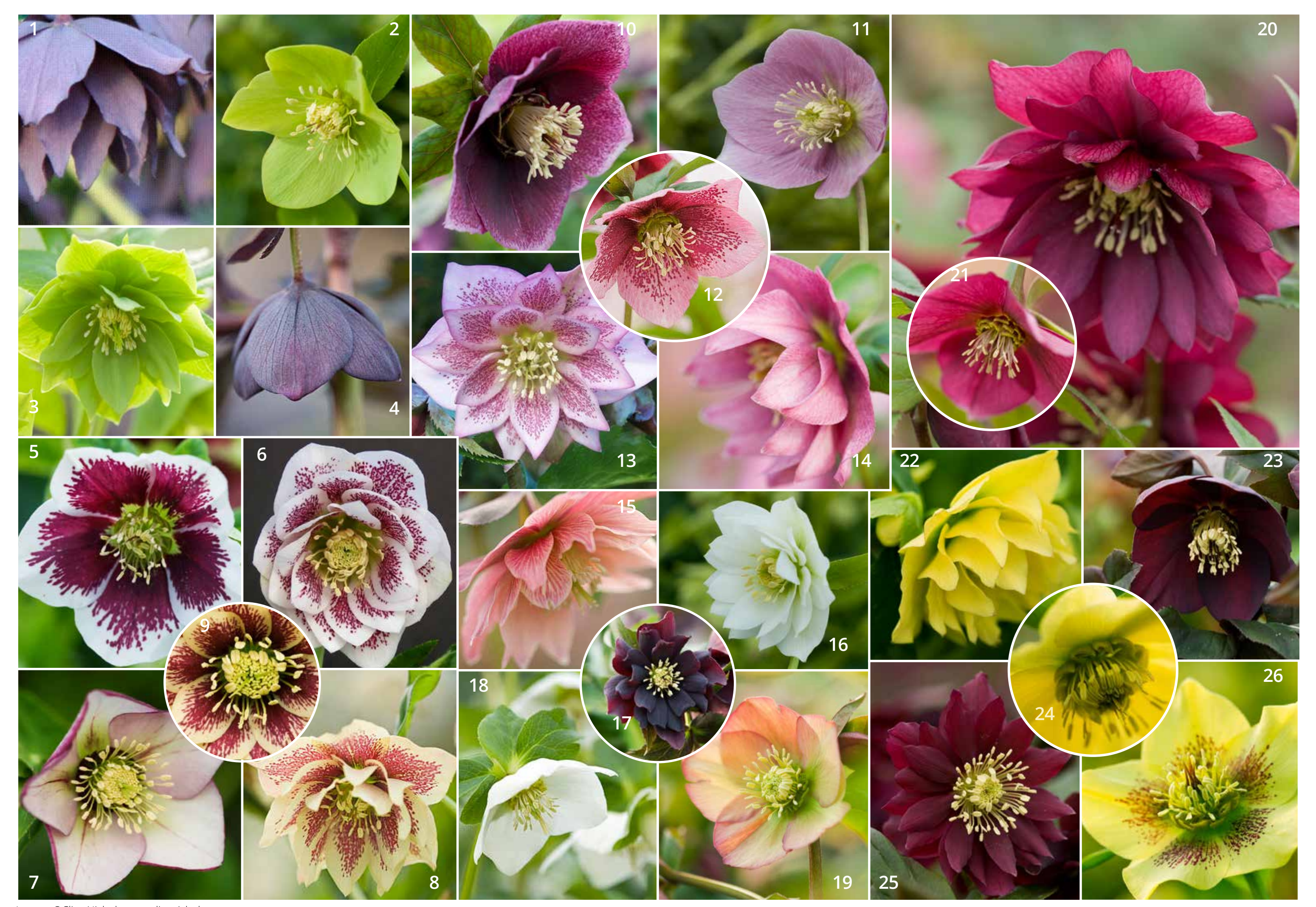
Images ©Clive Nichols www.clivenichols.com (with the exception of images 6, 11, 13, 16 and 28-31)